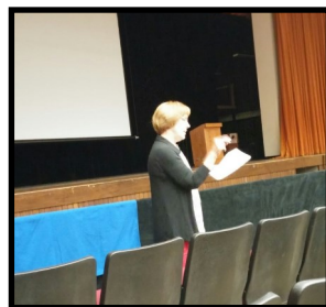
Racine and Janesville Leadership Training